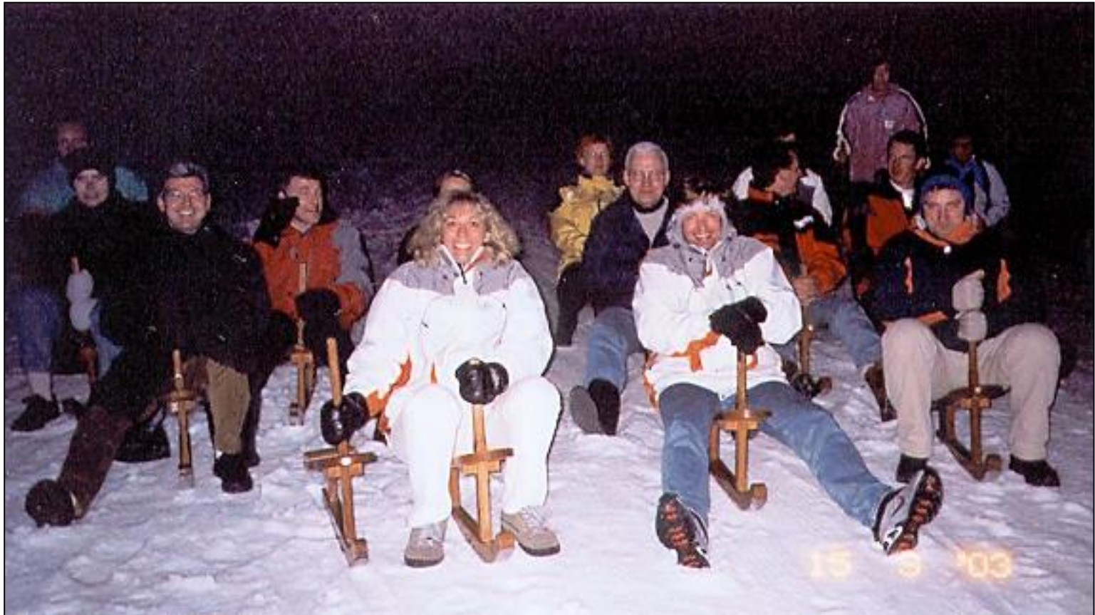
Snow meeting La Clusaz 2003