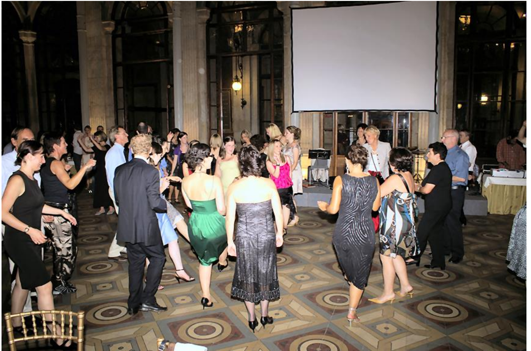
Congress Party Porto 2009