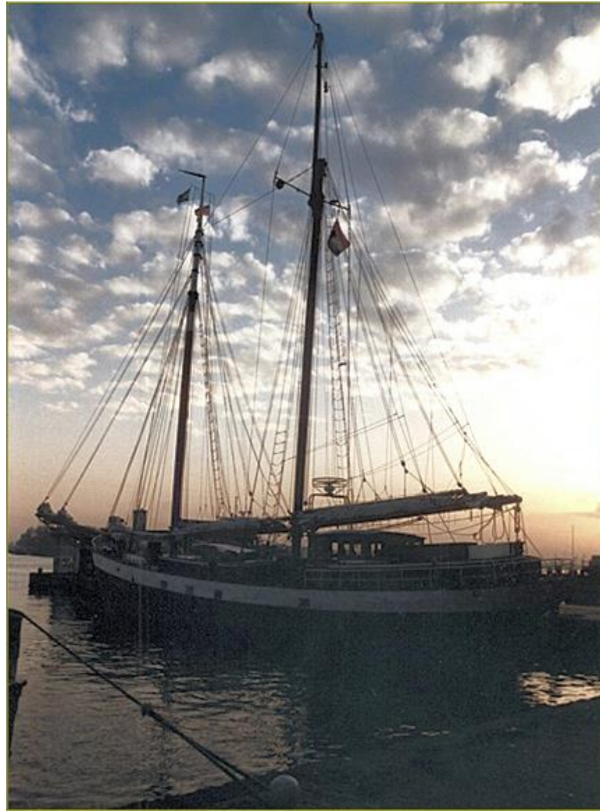
Marie Galante, Amsterdam, October 12-14, 1990