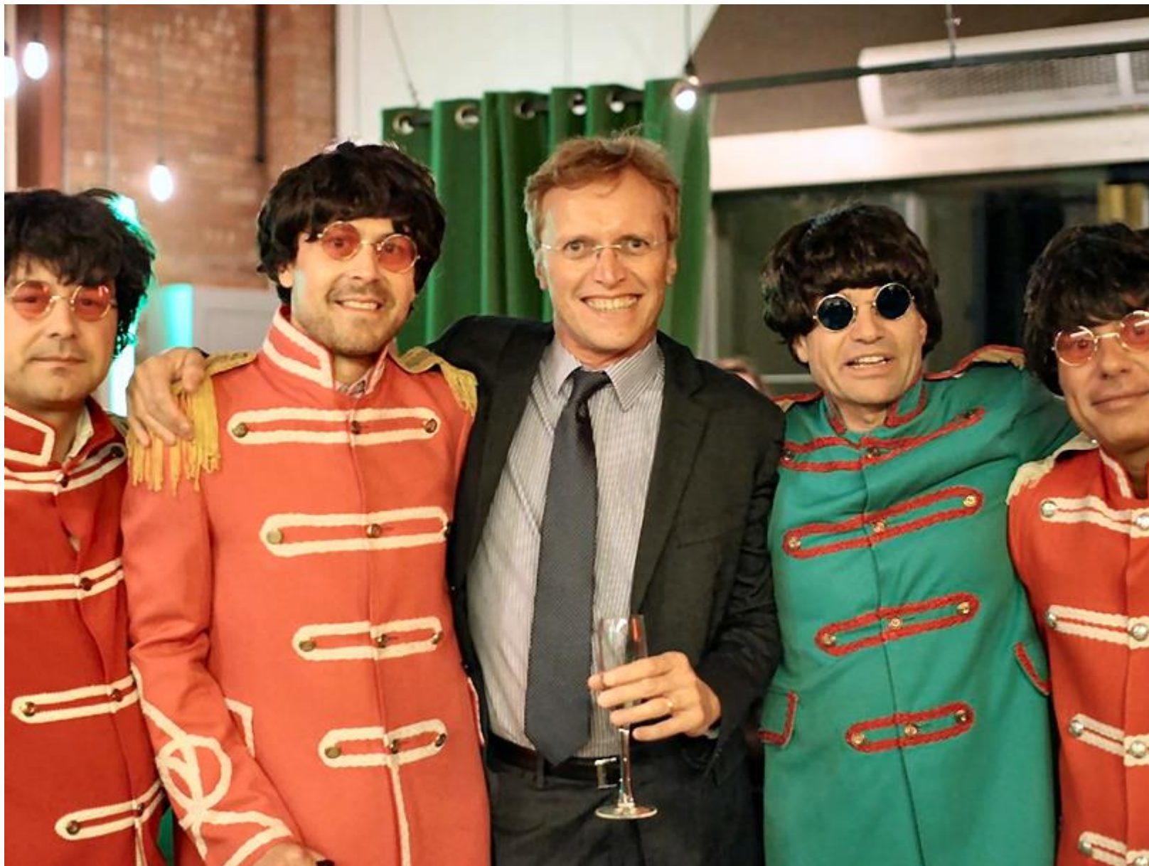
ECVIM-CA congress Liverpool 2013