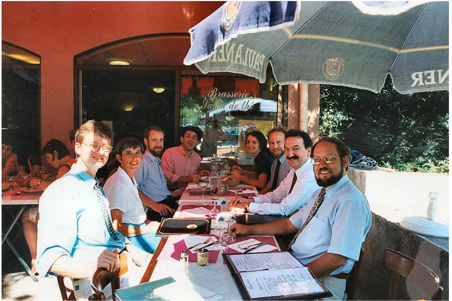
Lyon 1997: lunch Examination Committee, Board and exam candidates (!)