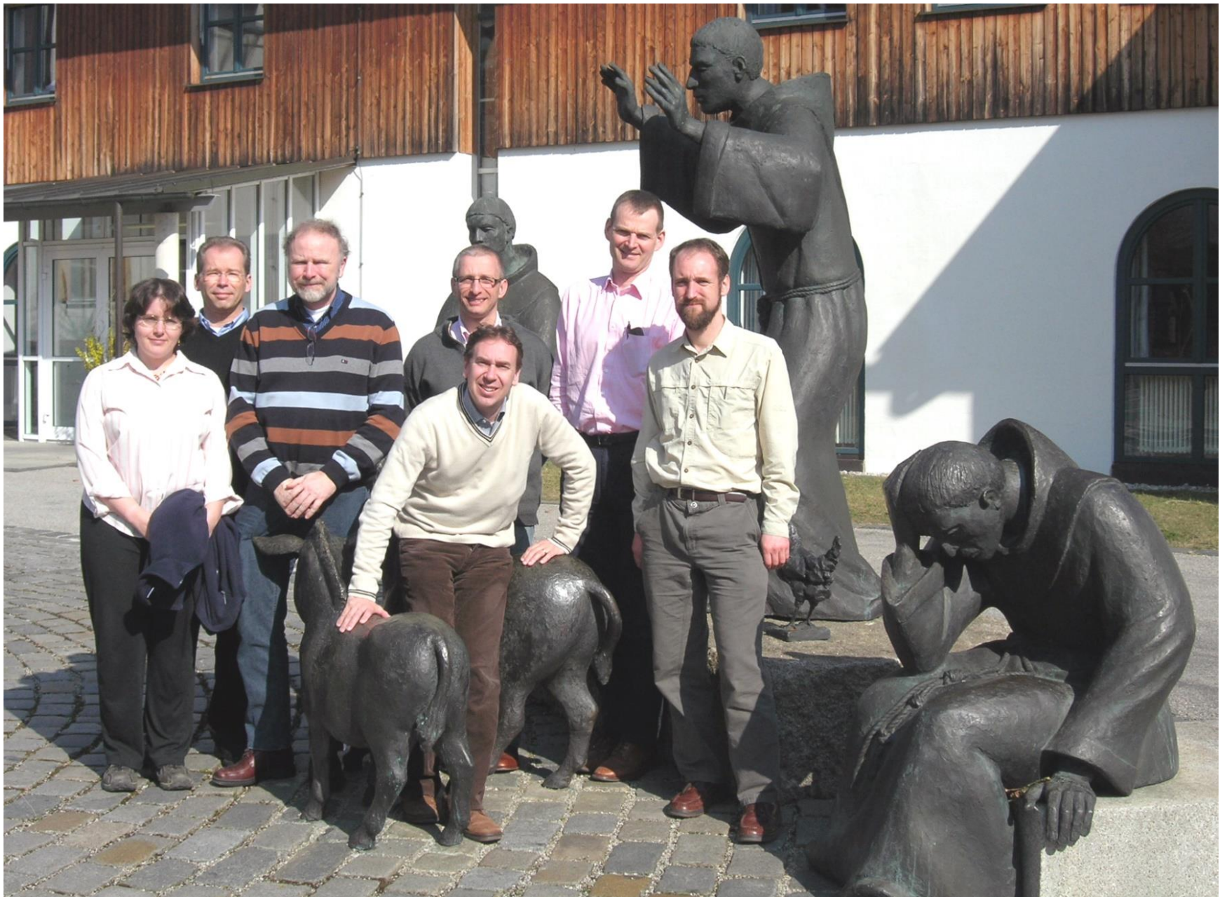
2008 ECVIM-CA receiving blessing