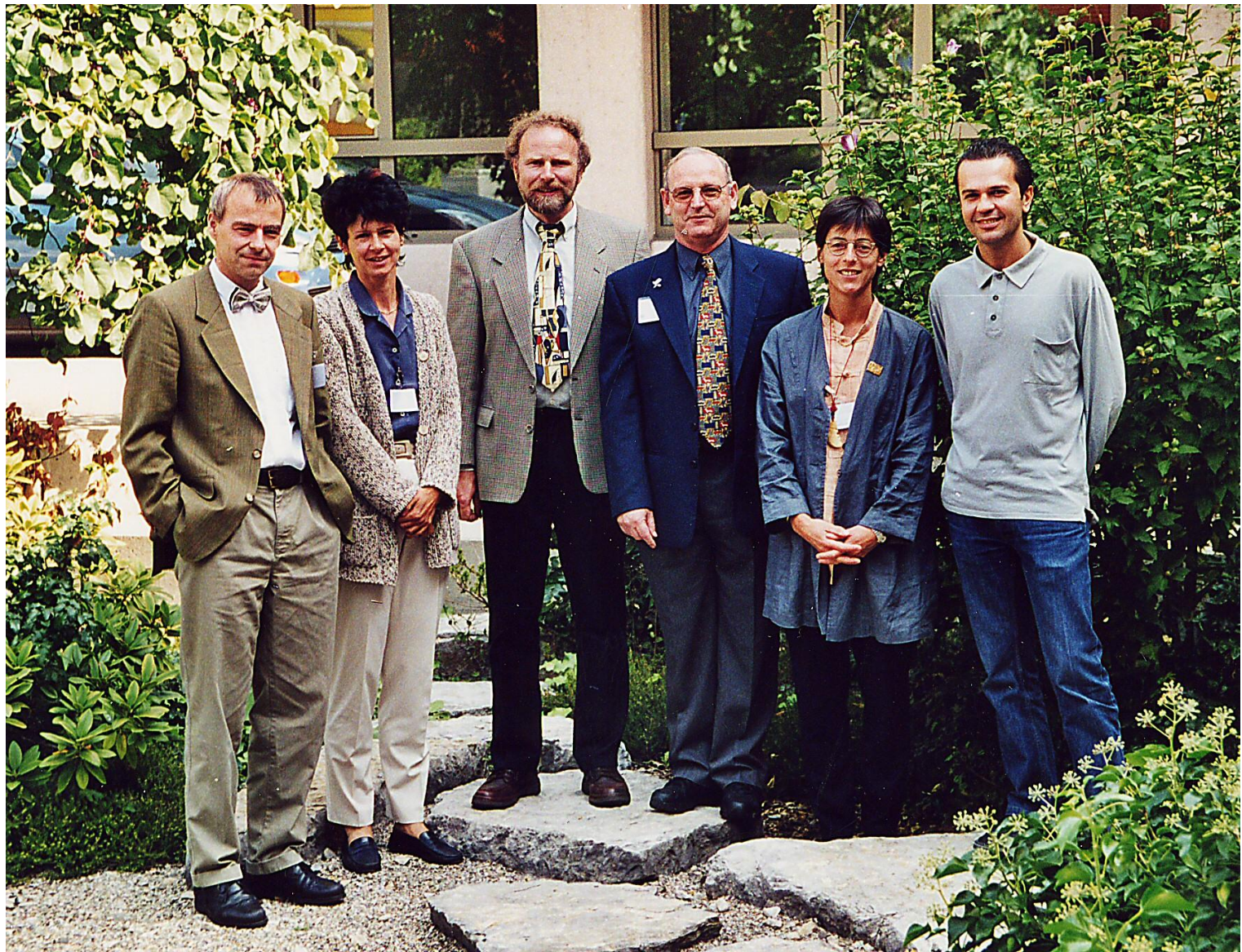
ECVIM-CA Board 2001