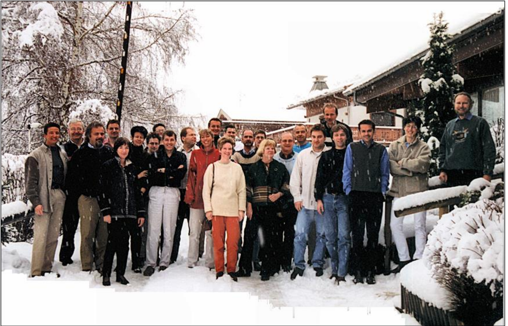
Snow Meeting Chamonix March 2000