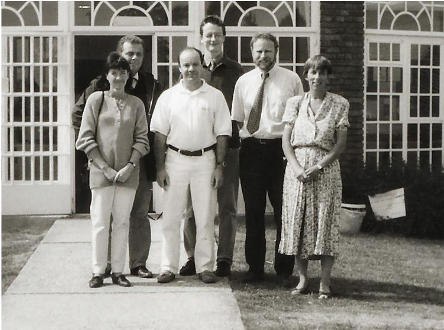
ECVIM-CA Board meeting, Cambridge 1995