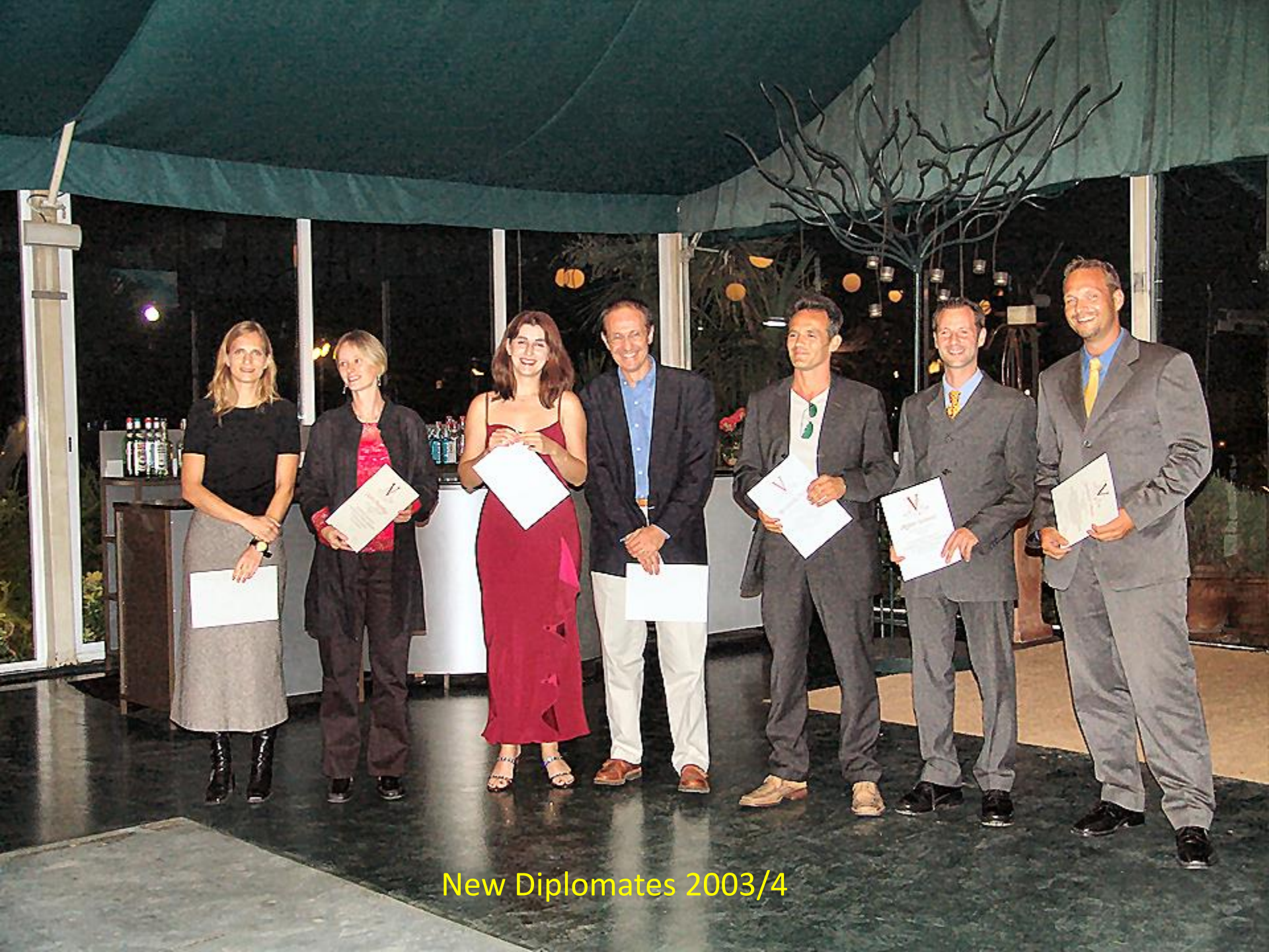
New Diplomates 2003/4