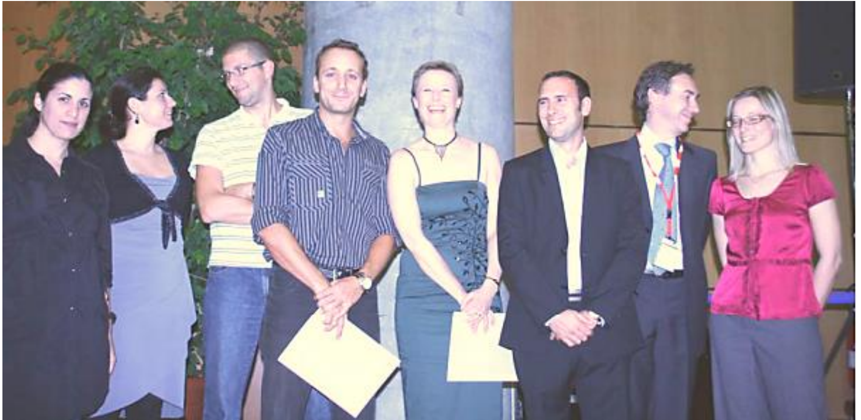
New diplomats 2010