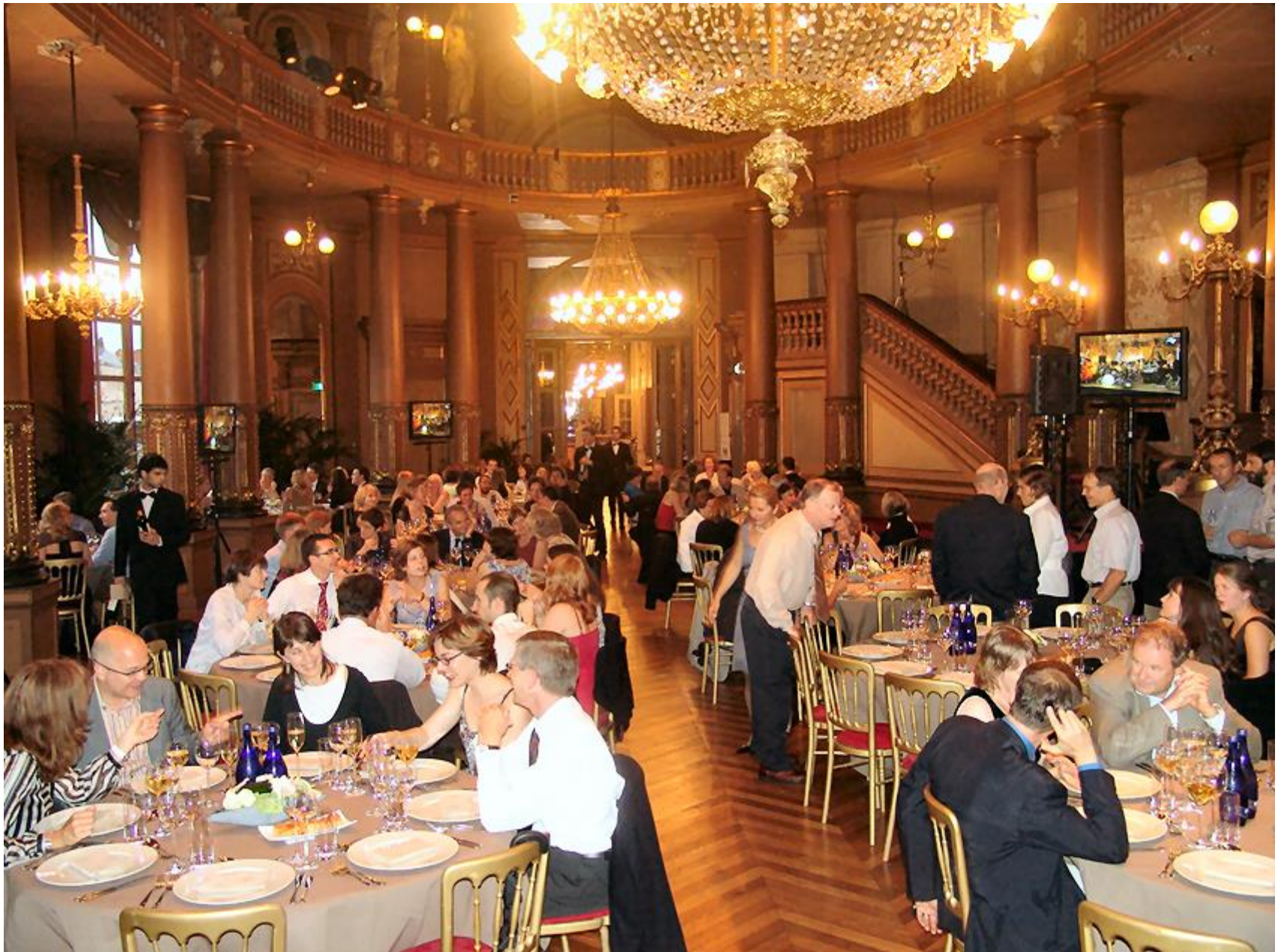
Congress Diner Ghent 2008