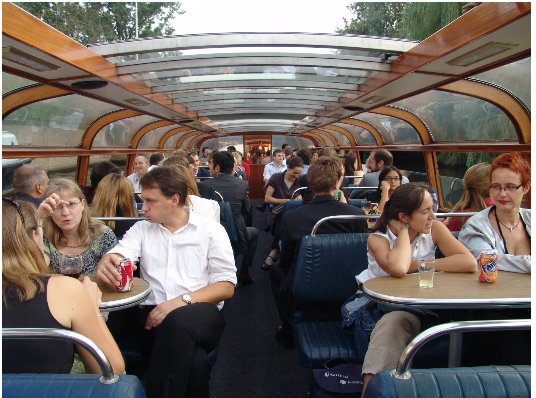
ECVIM-CA congress Amsterdam 2006