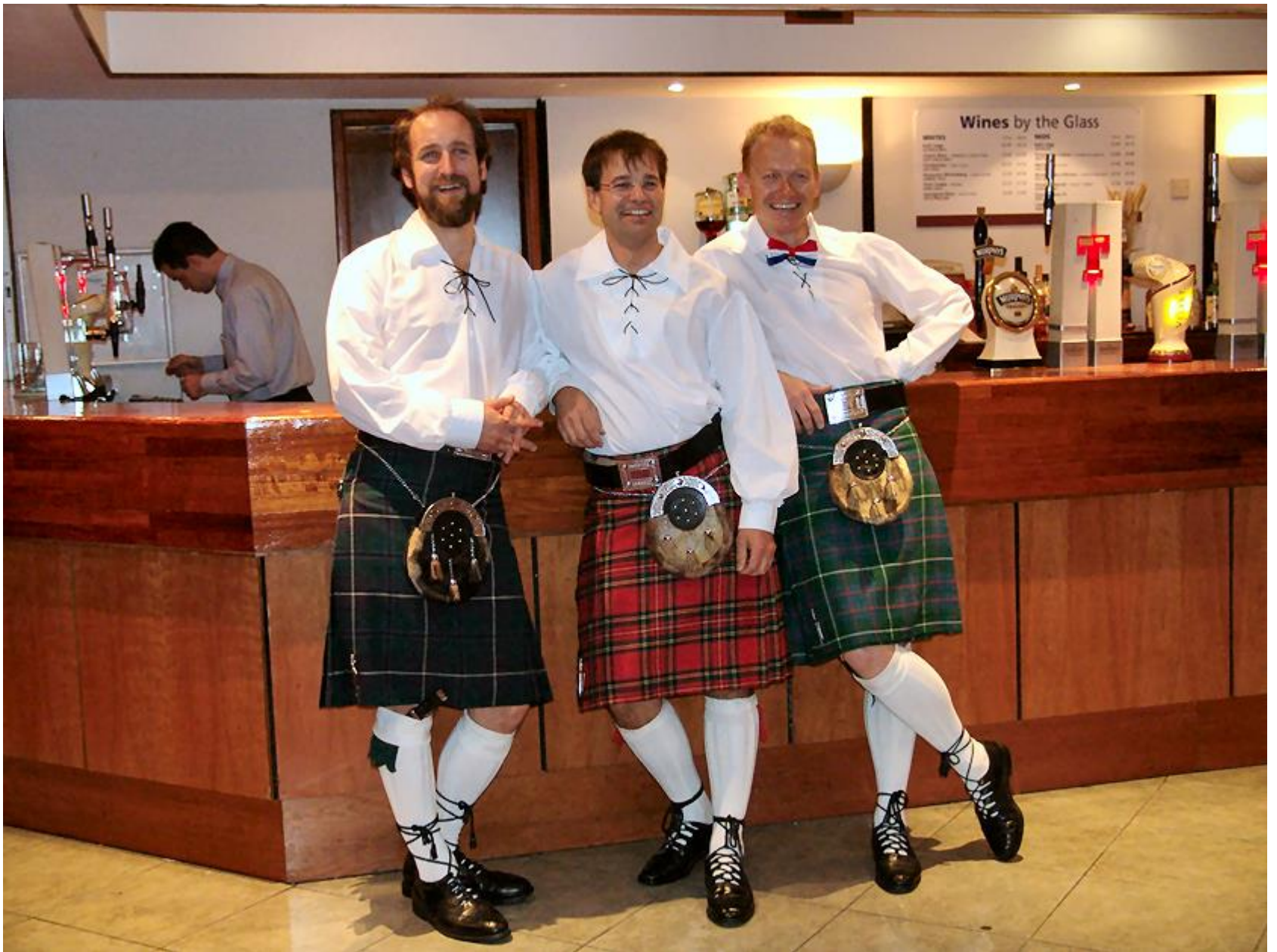
ECVIM-CA 2005 congress in Glasgow