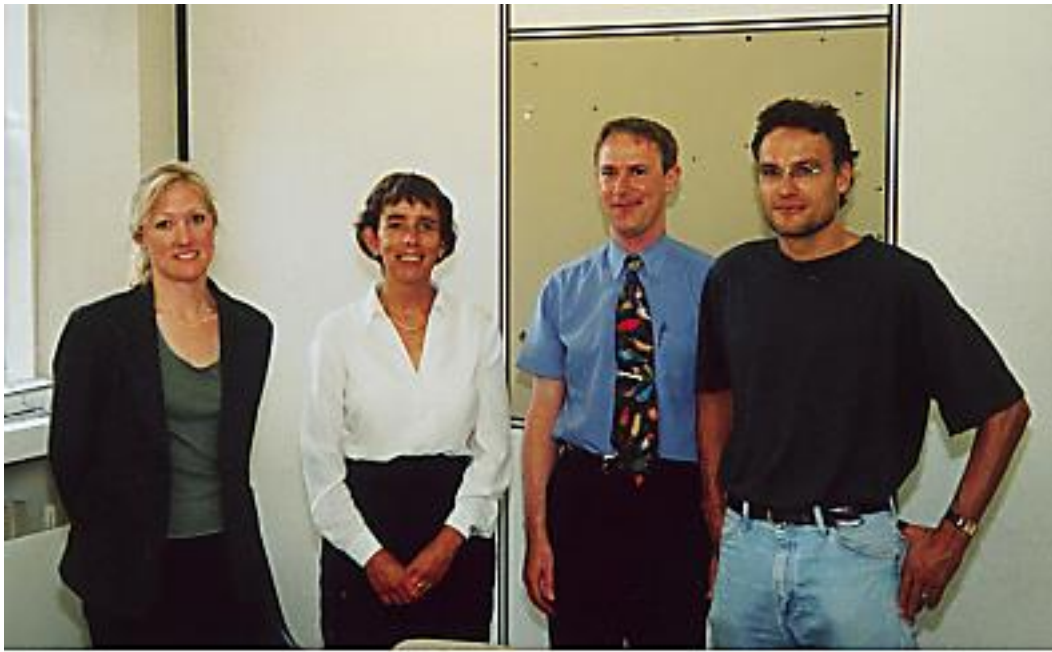
← Examination Committee Internal Medicine