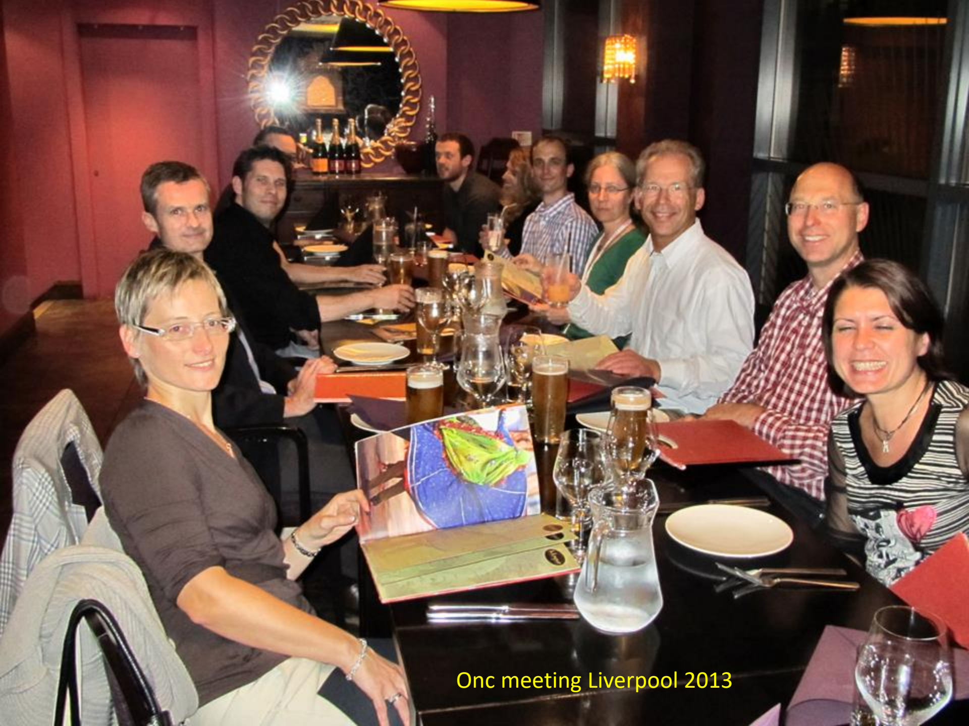
Onc meeting Liverpool 2013