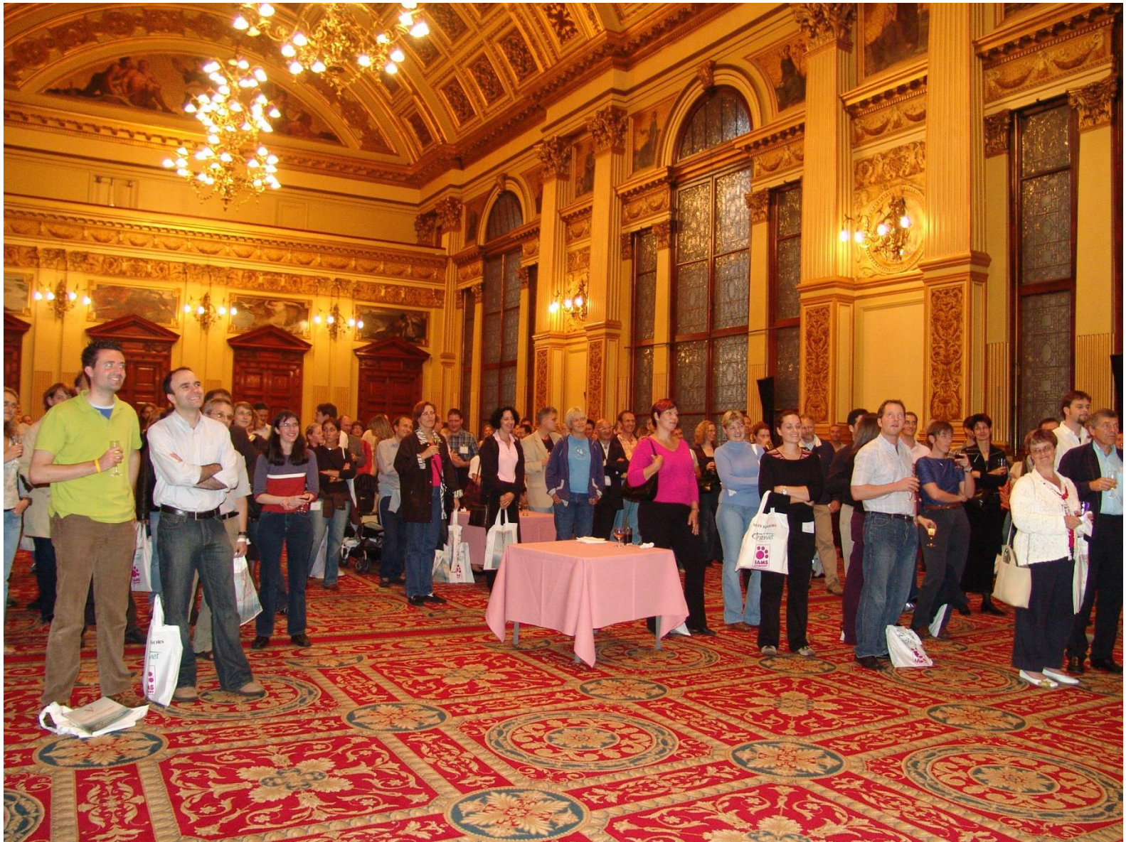
ECVIM-CA 2005 congress Welcome Reception