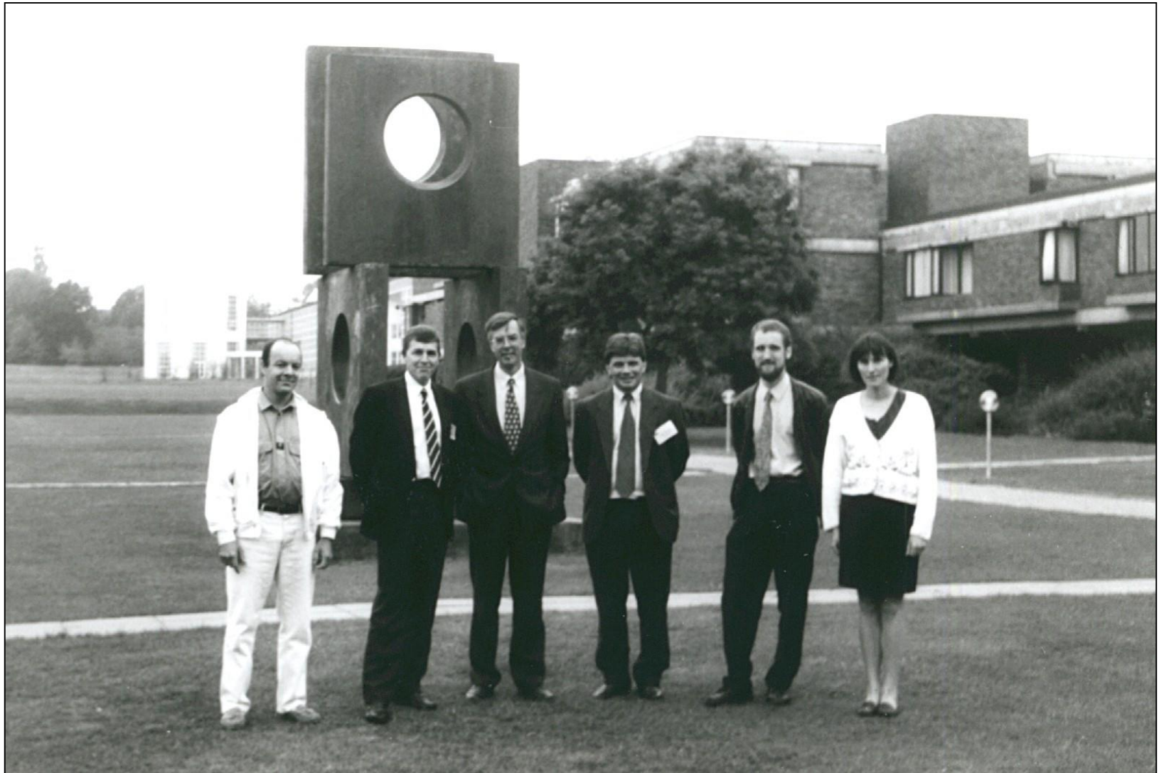
ESVIM Congress Committee Cambridge 1995