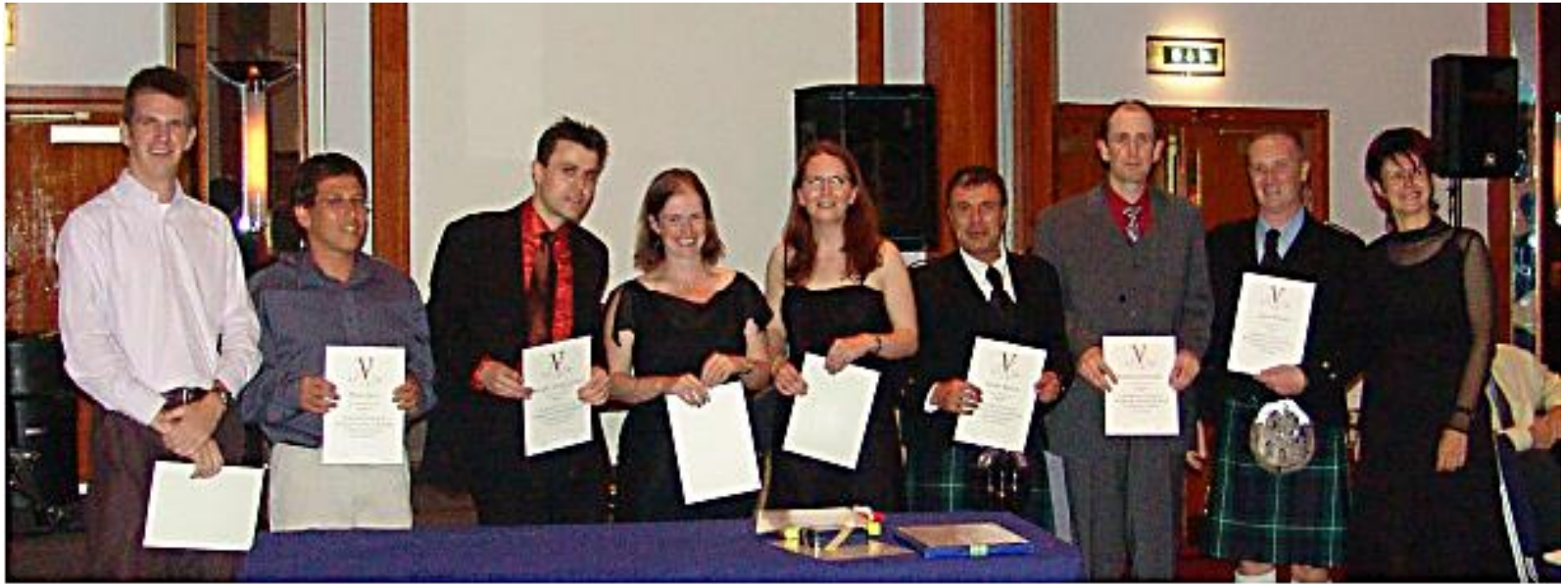
New diplomates 2004/5