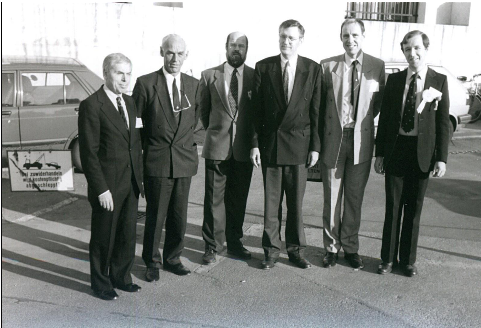
1 st ESVIM General Board, Vienna 1991